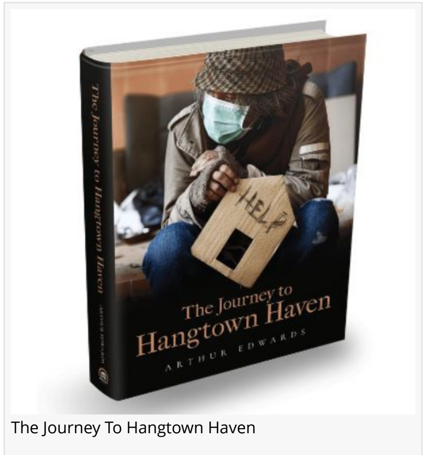
The Journey To Hangtown Haven