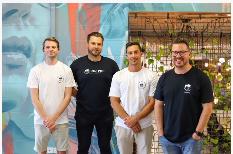
Little Phil Team AI Content Assistant for Charities

GOLD COAST, QLD, AUSTRALIA, March 25, 2024 /EINPresswire.com/ -- In a significant move to support the growing global charity sector, Little Phil (Little Philanthropist) today announced the launch of its innovative AI-powered Charity Assistant. This revolutionary tool is designed to guide nonprofit leaders through the complexities of the industry, offering 24/7 support in marketing, fundraising, and much more.