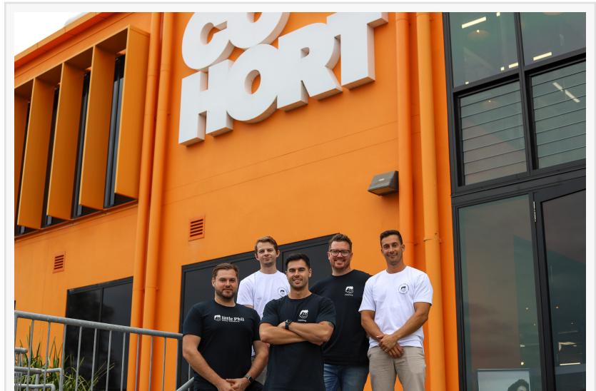
Little Phil(anthropist) Team - GC Young Entrepreneurs of the Year 2022

**Innovative Brainstorming Tool:** The assistant also serves as a creative partner, helping organizations brainstorm ideas for marketing, engagement, and beyond.