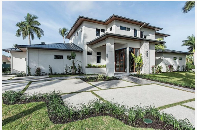
Hardwood Flooring In Miami