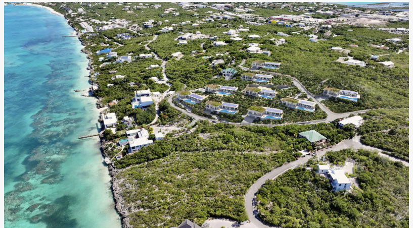
The Summit on Blue Mountain

This press release can be viewed online at: https://www.einpresswire.com/article/697557614