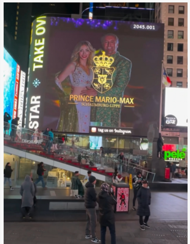
Prince Mario-Max Schaumburg-Lippe Billboard Times Square NYC