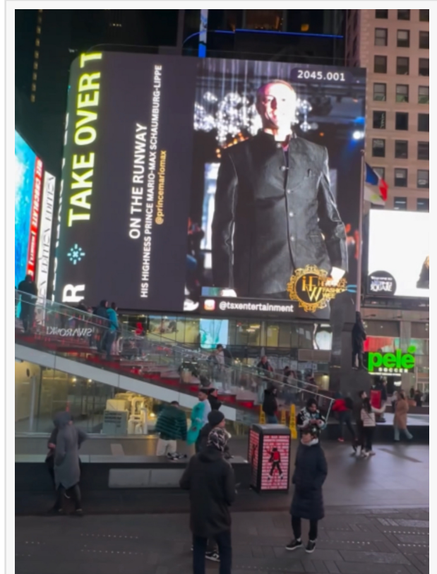
Prince Mario-Max Schaumburg-Lippe Billboard NYC

Fashion weeks are not only cultural events but also significant economic drivers. They attract a global audience of buyers, journalists, celebrities, and influencers to host cities. This influx of visitors generates revenue for hotels, restaurants, transportation services, and local businesses.