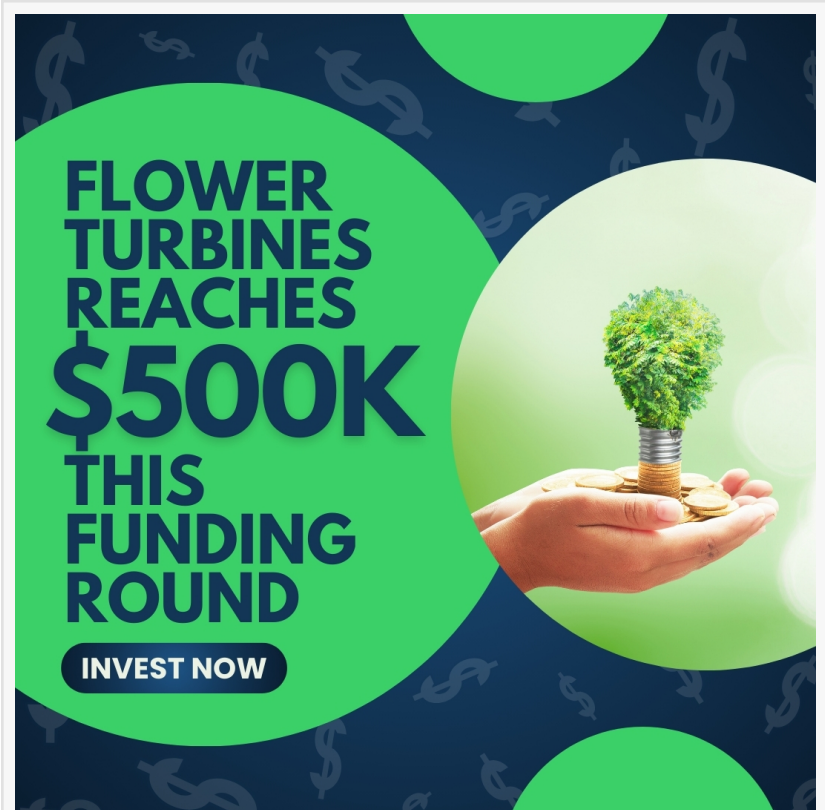
Flower Turbines Funding $500,000 in one week

This achievement underscores investor confidence and highlights the growing interest in sustainable solutions. With the infusion of capital, Flower Turbines plans to build and market