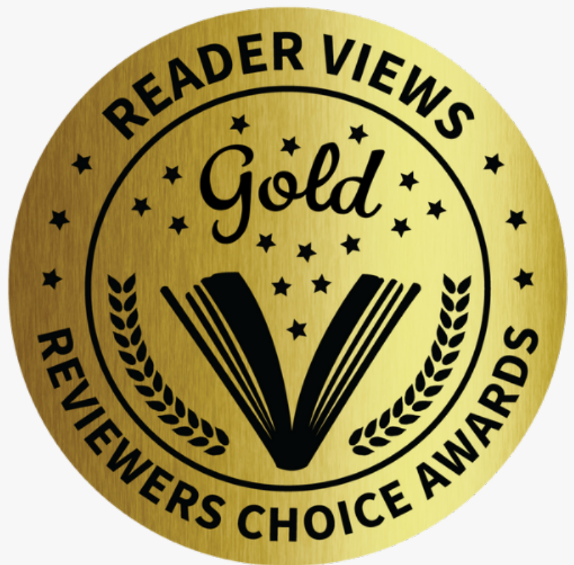
Best Historical Fiction 2023