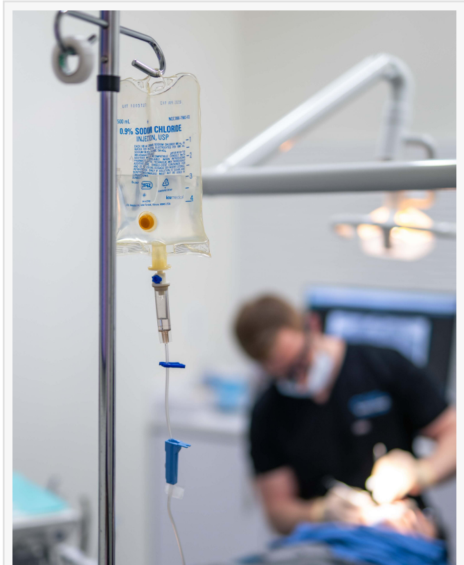
A patient experiences the advanced IV sedation dentistry at Atlanta Dental Spa.

Atlanta Dental Spa's IV sedation dentistry provides patients with a deep, yet fully controllable level of sedation. This option is ideal for those undergoing extensive dental procedures or who experience significant dental anxiety, allowing them to undergo treatment in a state of relaxation. IV sedation offers the advantage of adjustable depth of sedation, rapid onset, and the ability for patients to have little to no memory of the dental procedure, making it a highly preferred option for a stress-free dental experience.