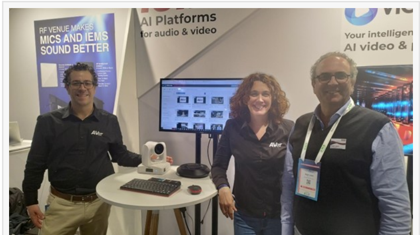
AVer Europe and ISID partnership

MADRID, MADRID, ESPAÑA, March 21, 2024 /EINPresswire.com/ -- ISID specializes in the development of advanced solutions for processing, analyzing, managing and storing audio and video content different sectors. Its flagship product, Videoma Archivo , an enterprise multimedia content management system (EVCM), is instrumental in facilitating the efficient management of video content in organizations such as courts, tribunals, municipalities and companies where these services are essential.