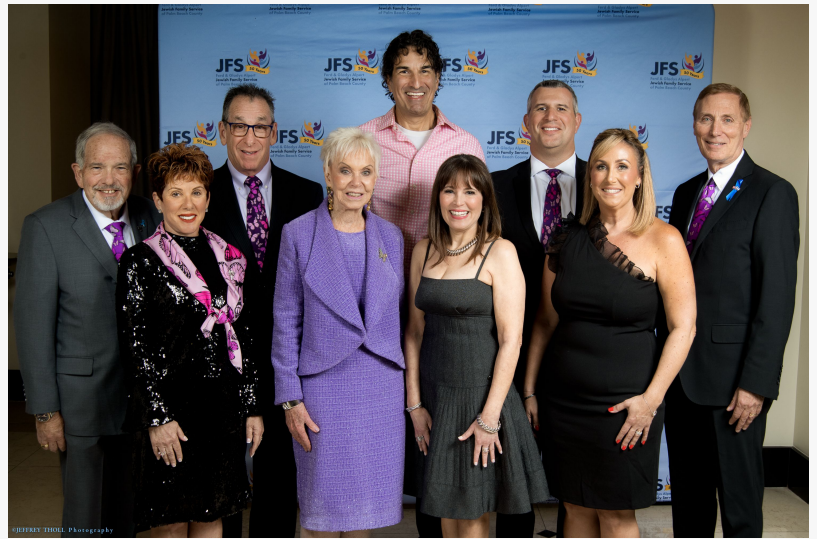
Alpert JFS Raises Over $750,000 at 20th Annual ‘No Excuse for Abuse’ Evening