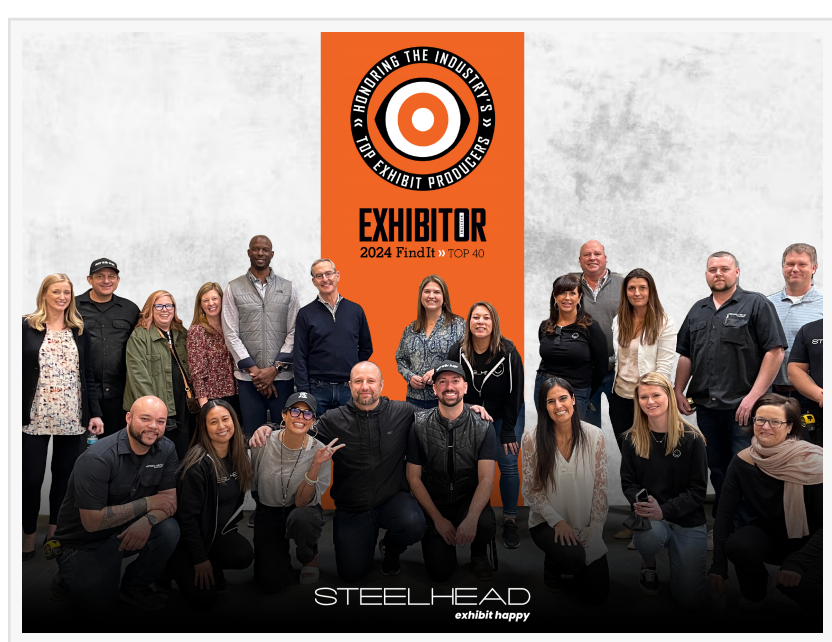
FindIt - Top 40 Steelhead 2024

LAS VEGAS, NV, UNITED STATES, March 21, 2024 /EINPresswire.com/ -- Steelhead Productions, a premier event, exhibit, and marketing services provider, is thrilled to announce its continued recognition on the prestigious EXHIBITOR Group's FindIt - Top 40 list for 2024, securing its place among the best exhibit producers in the country.