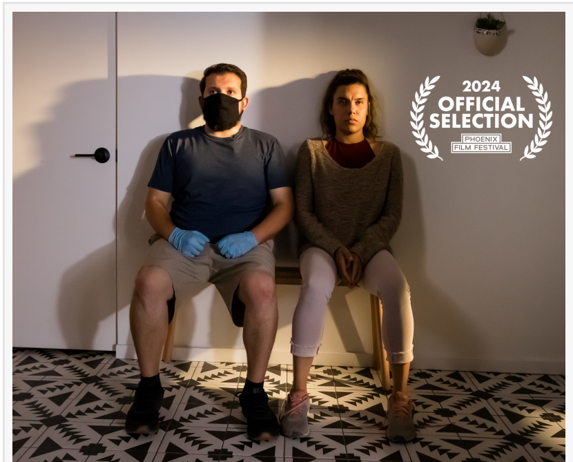
A Personal Pandemic - Phoenix Film Festival April 6, 2024