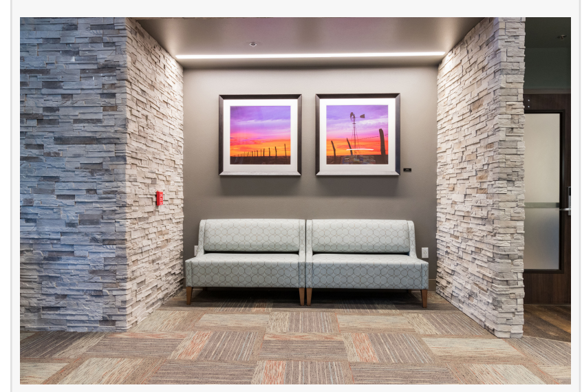
Patient Waiting Area in an Amarillo TX Hospital