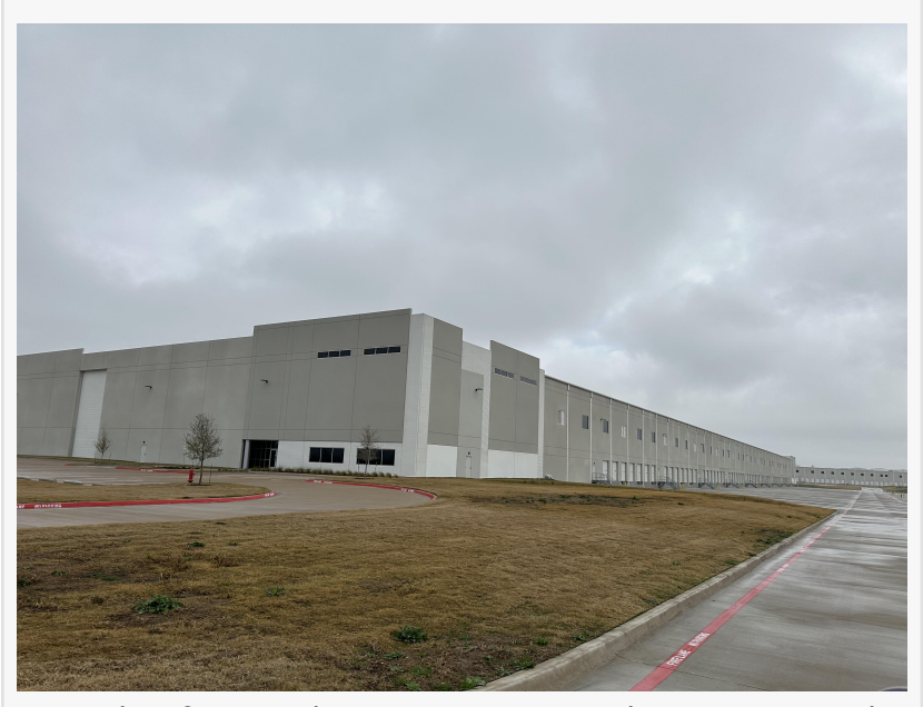
Outside of Legendz Way at Crossroads Logistics Park in Midlothian, Texas

"Expanding our footprint is just part of