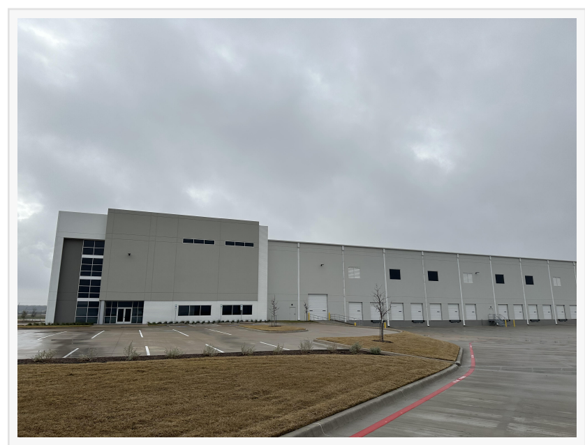
Outside of Legendz Way at Crossroads Logistics Park in Midlothian, Texas

The new facility in Midlothian, complemented by the existing location on DFW Airport property in Irving, showcases Legendz Way's dedication to optimizing its logistical footprint. This expansion is key to supporting the requirements of both traditional pallet in/out distribution channels and advanced e-commerce platforms, marking a significant step in the company's growth and its ability to serve a wide array of consumer and business needs.