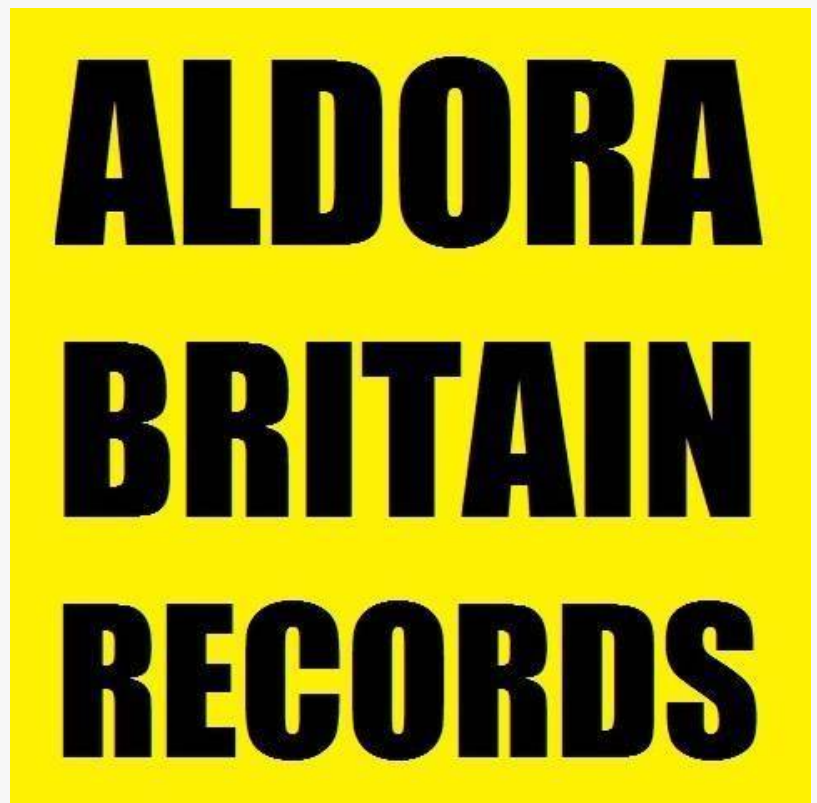
Aldora Britain Records Logo