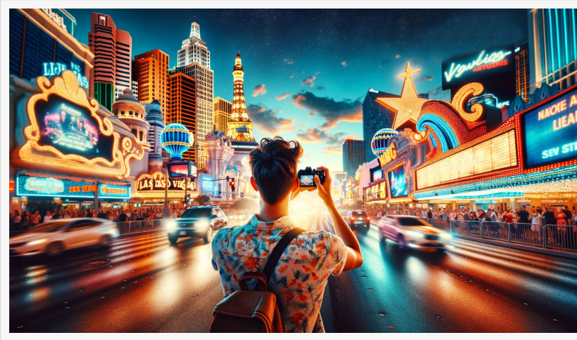
Taking a Picture on the Las Vegas Strip

Filmmakers looking to capture the beauty and vibrancy of the Silver State now have to navigate a new set of regulations to bring their cinematic visions to life. This recent development has sparked discussions among seasoned professionals and aspiring creators alike, raising questions about the impact on the film industry in Nevada and beyond.