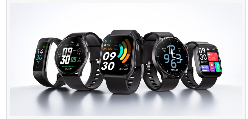
Starmax 2024-Feb Product Range

The Global Sources Mobile Electronics Show is one of the world's largest mobile electronics trade fairs, covering a wide range of mobile devices, smart wearables, mobile accessories, and true wireless audio products. The show will be held at the AsiaWorld-Expo in Hong Kong from April 18 to 21, 2024. Starmax will meet you at booth 5J14 in Hall 5.