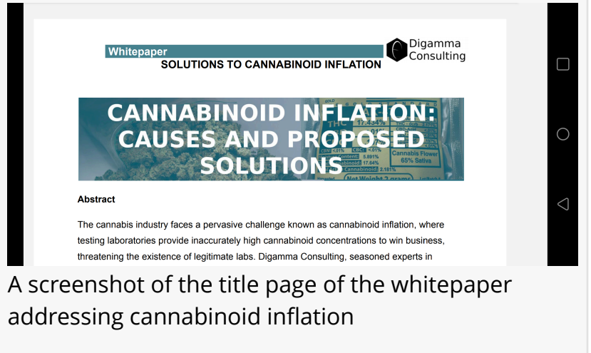
A screenshot of the title page of the whitepaper addressing cannabinoid inflation