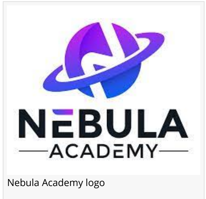
Nebula Academy logo