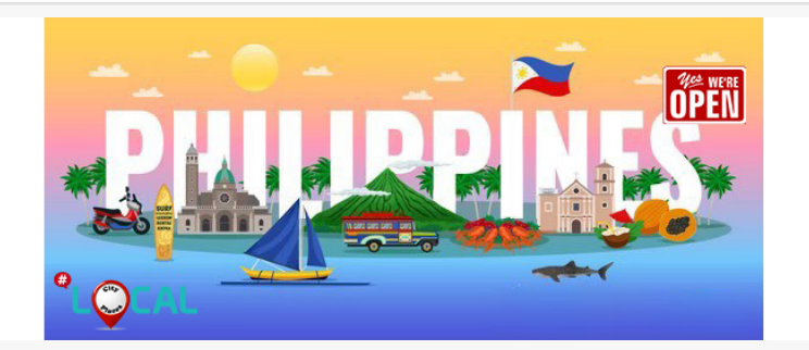
Philippines OPEN March 22 2024

With a population exceeding 100 million people, the Philippines