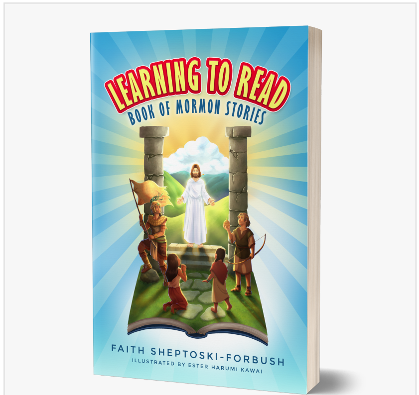
Learning to Read: Book of Mormon Stories Audiobook