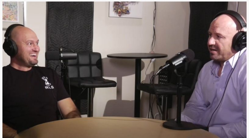
Real Life School introduces monthly podcasting episodes featuring insightful discussions with mentors, emphasizing their collective commitment to fostering a vibrant community.