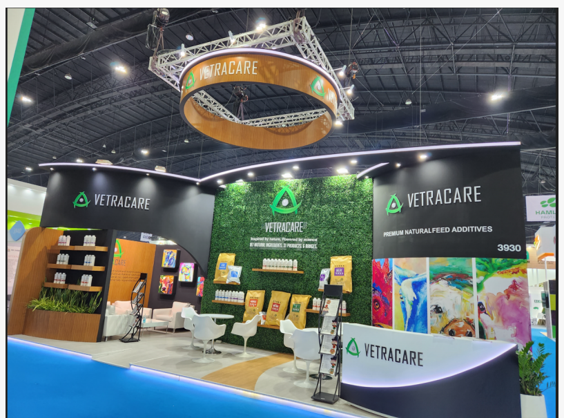
Vetracare Pte Ltd

In addition to traditional booth elements, Pixelmate incorporates cutting-edge technology to enhance the visitor experience. Interactive displays, virtual reality demonstrations, and augmented reality applications are just a few of the tools the company employs to create engaging and memorable booth environments.