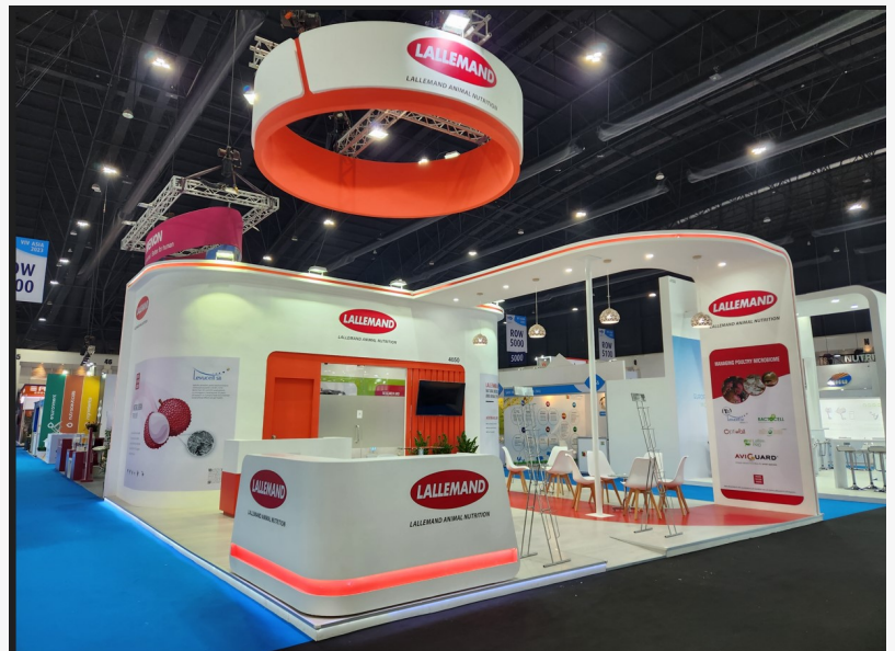
Lallemand Animal Nutrition