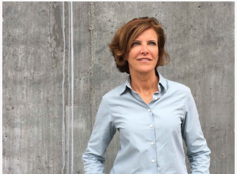
Architect Jeanne Gang