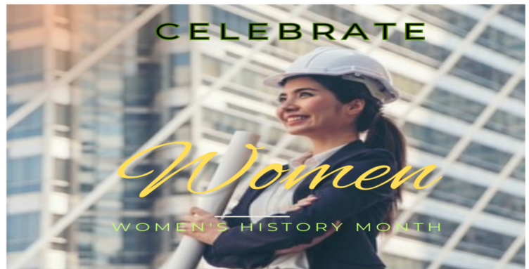
Celebrating Women's History Month