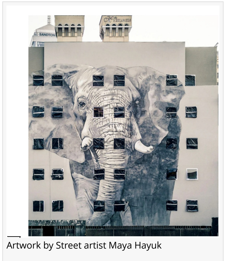
Artwork by Street artist Maya Hayuk

This press release can be viewed online at: https://www.einpresswire.com/article/698464795