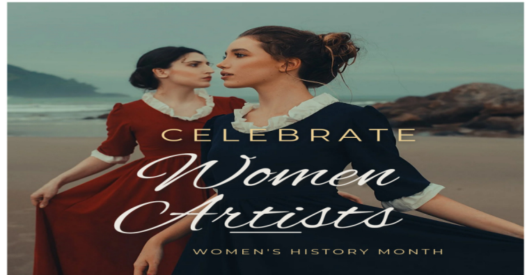
Celebrating Underground Women Artists

Hayuk's large-scale murals are celebrated for their bold, geometric patterns, drawing inspiration