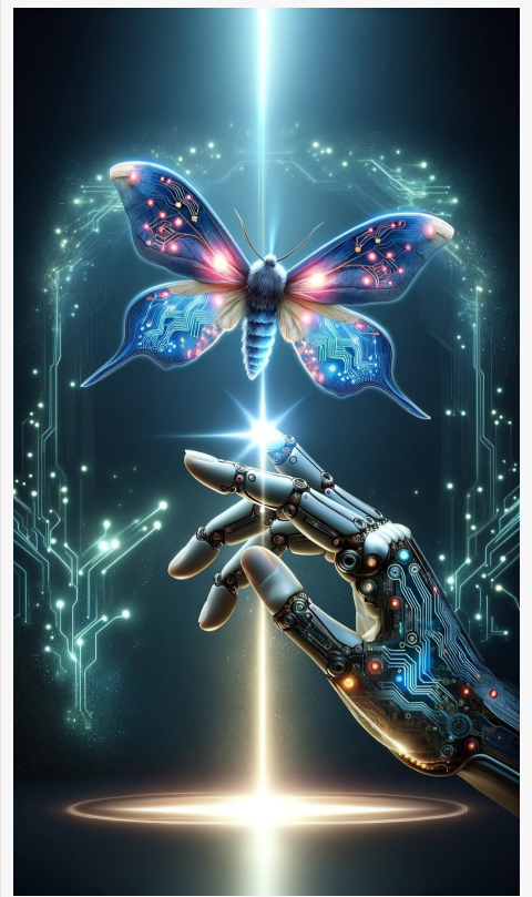
Silk moth taking off from AI's hand

This press release can be viewed online at: https://www.einpresswire.com/article/698544034