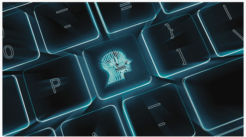
Bifin AI - Keyboard's AI button