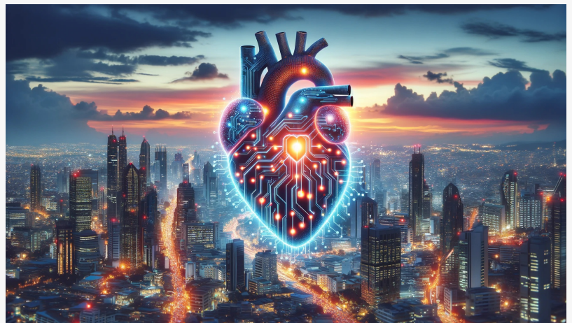
Innovative circuit heart against cityscape