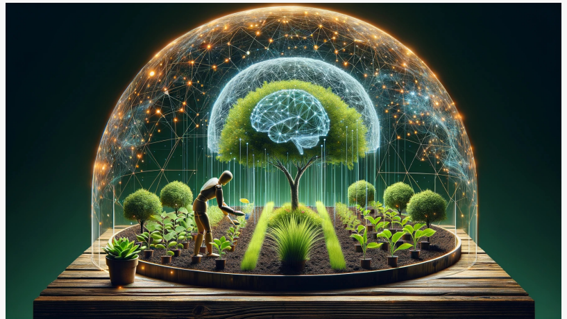
Bifin AI ecosystem nurtured in a transparent dome