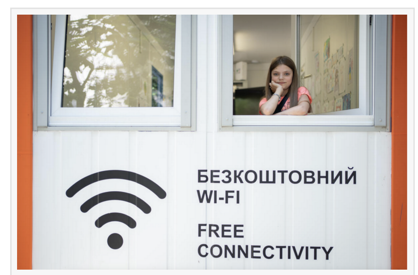
Free WiFi Service for Ukrainian Refugees

The N50 Project invites organizations and individuals passionate about sustainability to join the growing community and be part of the journey towards a more resilient, equitable, and sustainable world.