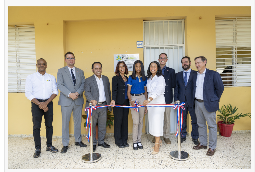
N50 Partners Initiating an N50 Ed-Tech Project in Dominican Republic