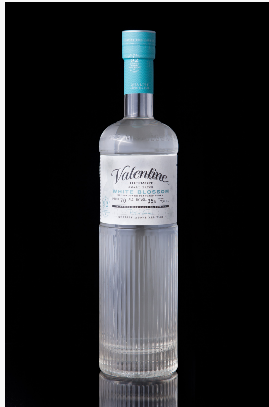
Valentine White Blossom Vodka