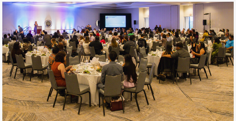
Attendees are shown at CPTP's third year anniversary gala in Long Beach California, Oct. 2023.