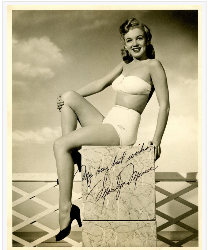
PSA/DNA graded 10 vintage black and white pin-up photograph of Marilyn Monroe, taken circa 1947, the first known instance of her signing a photo as “Marilyn Monroe,” using her recently adopted stage name (est. $28,000-$35,000).

Lincoln Memorial in his March on Washington. The mimeograph was run off by March’s Press