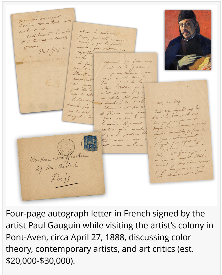
Four-page autograph letter in French signed by the artist Paul Gauguin while visiting the artist's colony in Pont-Aven, circa April 27, 1888, discussing color theory, contemporary artists, and art critics (est. $20,000-$30,000).