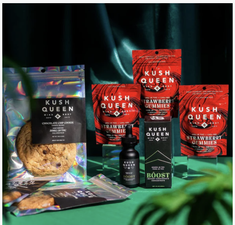
4/20 Party Pack