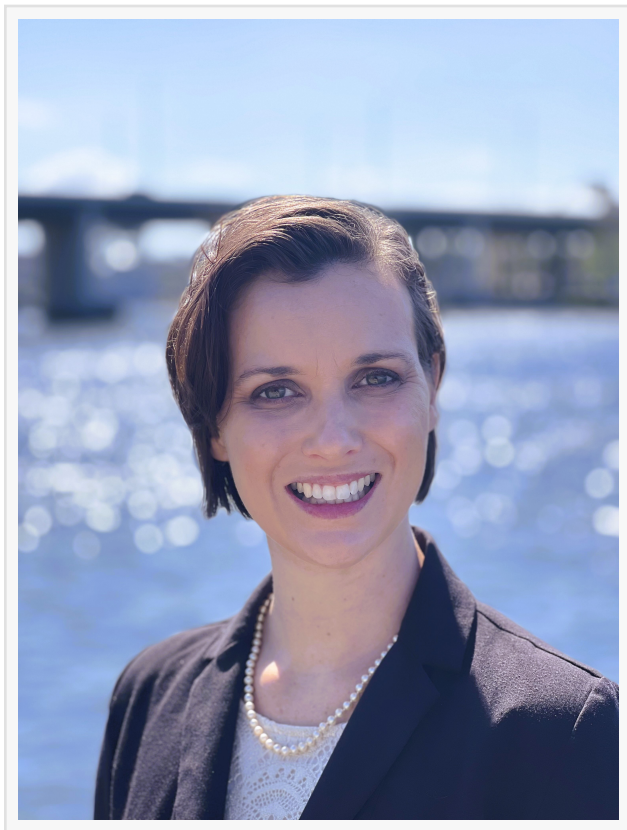
Human Resource Agency Florida