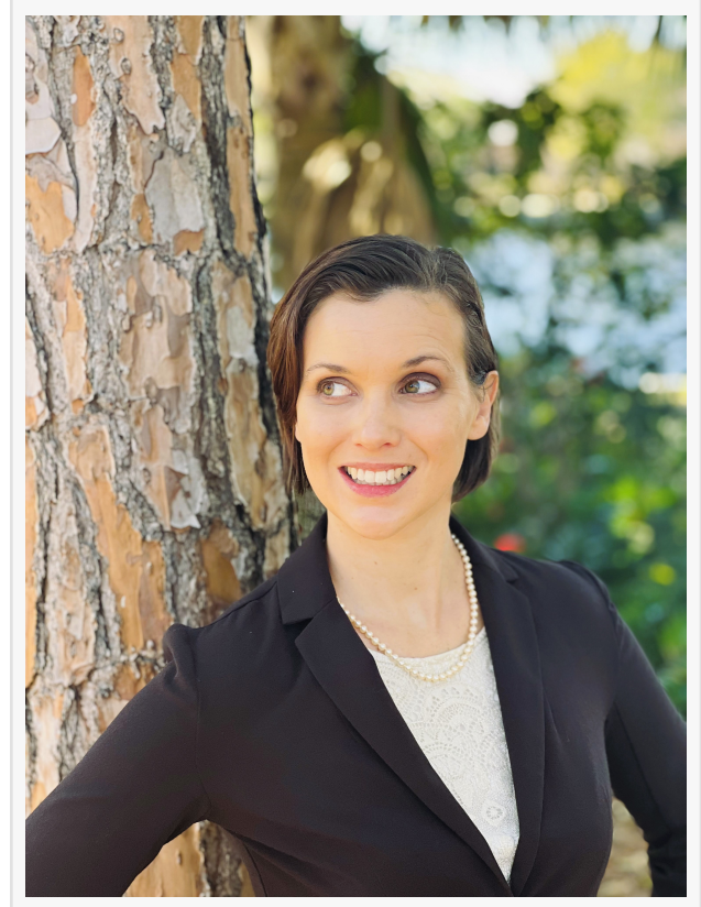
SHRI Company Owner