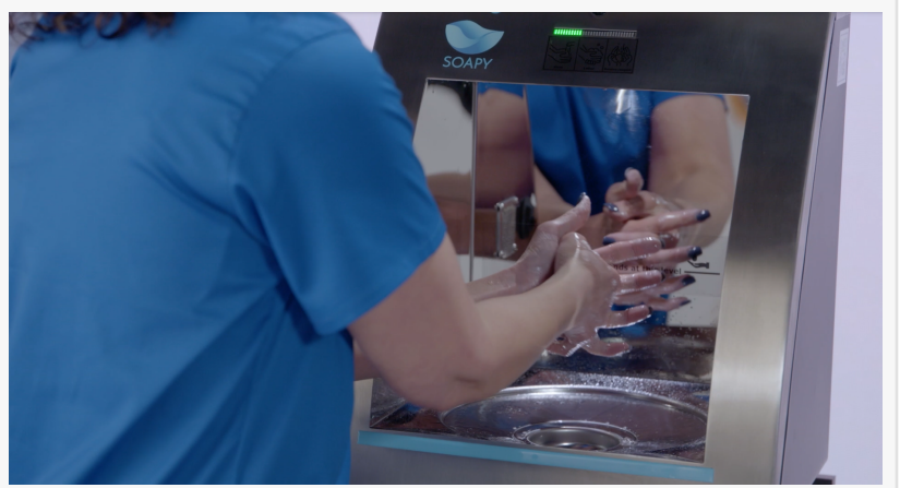
Using Soapy handwashing system