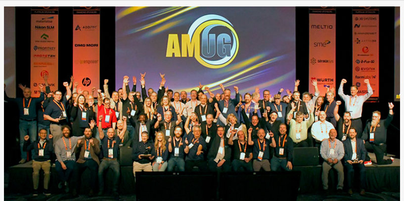
DINO's from the past 26 years gathered to celebrate the 2024 AMUG Conference.

The new DINO's have played varied roles in making the AMUG Conference a positive experience for those seeking insights, information, and connections, as well as making AMUG a strong organization. Although their contributions are many, the selection committee cited the key activities on which the DINO Awards were presented.