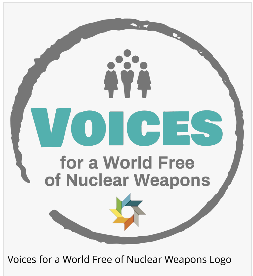
Voices for a World Free of Nuclear Weapons Logo