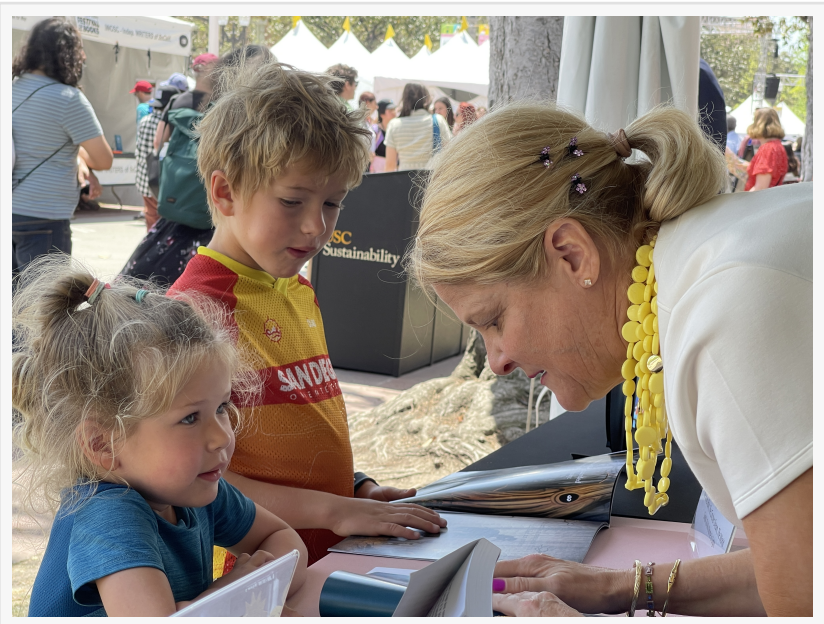
Author and children at Black Chateau at LA TIMES Festival of Books

LOS ANGELES, CALIFORNIA, UNITED STATES, March 26, 2024 /EINPresswire.com/ -- Black Château and Books That Make You host an array of authors and books at The Los Angeles Times Festival of Books. BookFest Award winners, debut authors, as well as many familiar faces and literary legends will be spotlighted in Booth 153 in the Gold Zone. The Los Angeles Times Festival of Books is one of the largest literary events in the