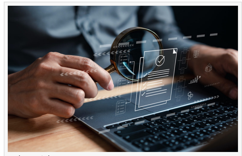
Cyber Risk Assessment

Proactive security measures are essential for mitigating risks and deterring potential threats against VIPs and HNWIs. These measures may include the deployment of highly trained executive protection teams to provide 24/7 personal security, the implementation of secure transportation protocols for travel, the installation of advanced surveillance and monitoring systems at residences and offices, and the establishment of strict access control measures to