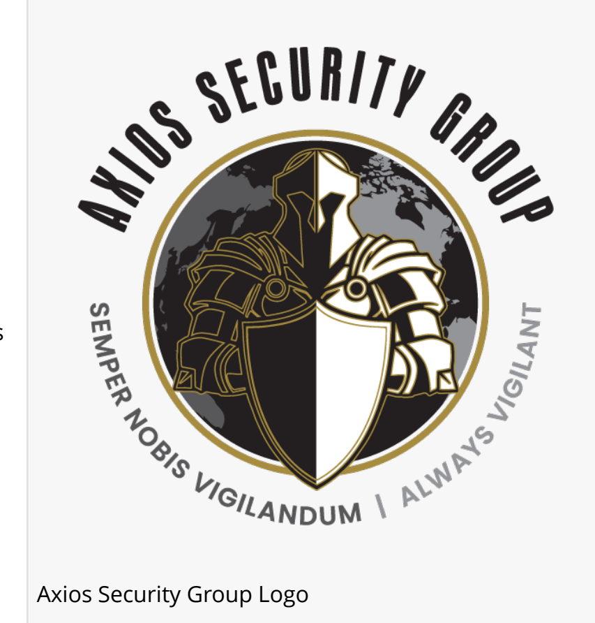
Axios Security Group Logo

restrict unauthorized entry to private spaces. By adopting a proactive approach to security, VIPs and HNWIs can significantly reduce their exposure to potential threats and enhance their overall safety and security.