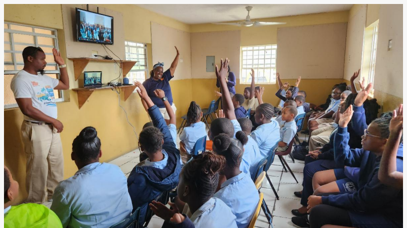
First Step Academy students learn about marine programs during a virtual session.