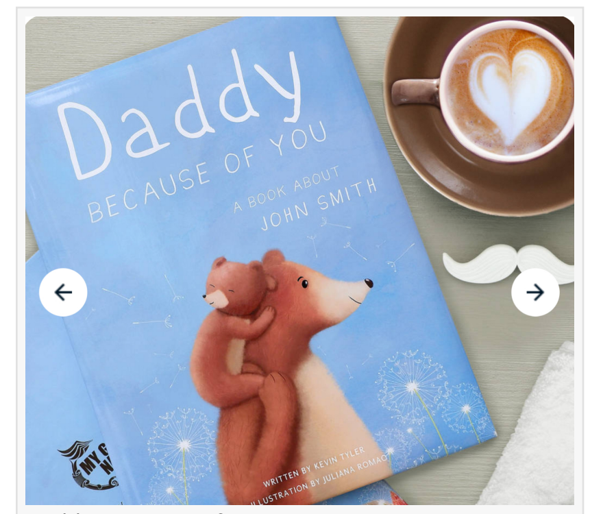
Daddy - Because of you

The range also includes a further three 'Daddy and me' books, including 'Becoming Daddy', 'My Superhero Daddy' and the brand new 'Daddy, if