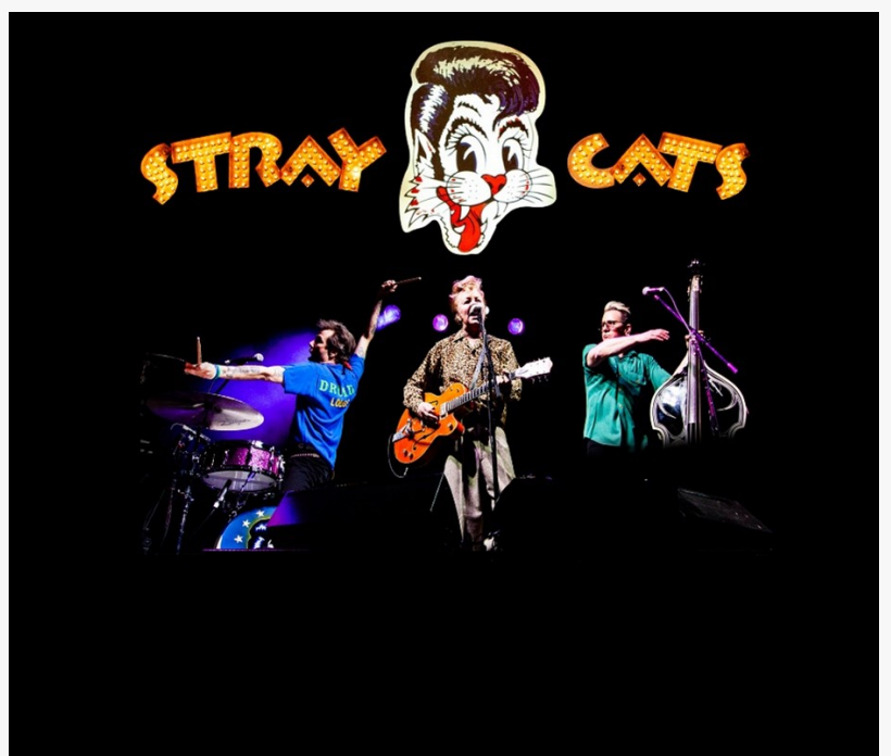
Coming this Summer

Saturday, August 3rd at The Rady Shell at Jacobs Park in San Diego, CA