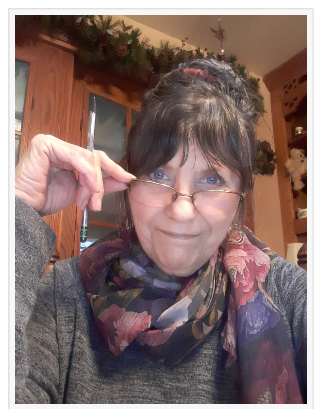
As fiction merges with reality, I keep pencil to paper.