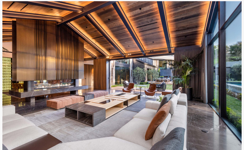
Double-vaulted wood ceilings and walls of glass