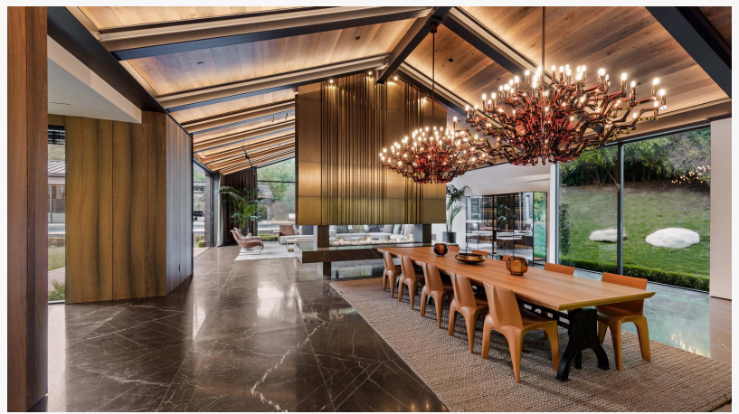
Striking modern farmhouse designed by Nobel LA

into the outdoor patio complete with a cozy fireplace, offering beautiful views of the pool. It lies off the great room and leads to a hidden professional-grade chef’s kitchen, ideal for entertaining behind the scenes. The backyard space offers an alfresco dining area, a fireplace, and a cabana