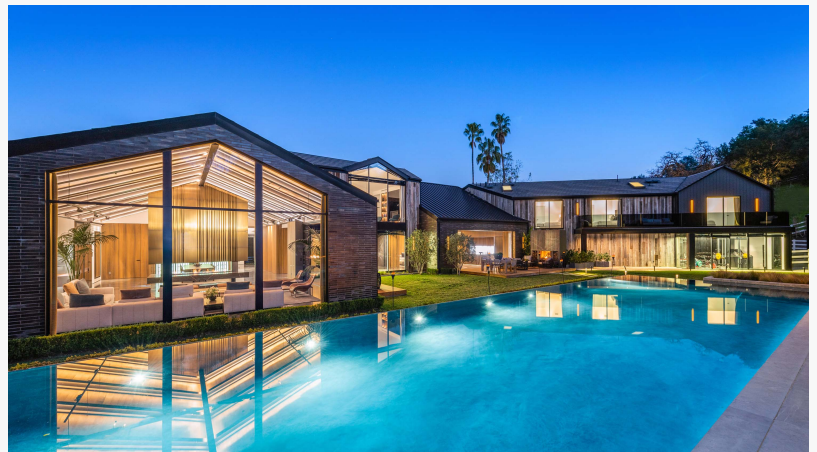
24350 Bridle Trail Rd, Hidden Hills, Los Angeles Area, California

of a private cul-de-sac, embraced by lush landscaping, olive trees, and verdant greenery, the mansion was crafted in 2021 by Max Nobel of Nobel LA and boasts seven bedrooms, eight bathrooms, soaring 40-foot ceilings complemented by exposed steel beams and a 65-foot pool.