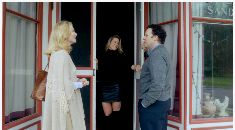
SEASONS: four love stories.Still 1