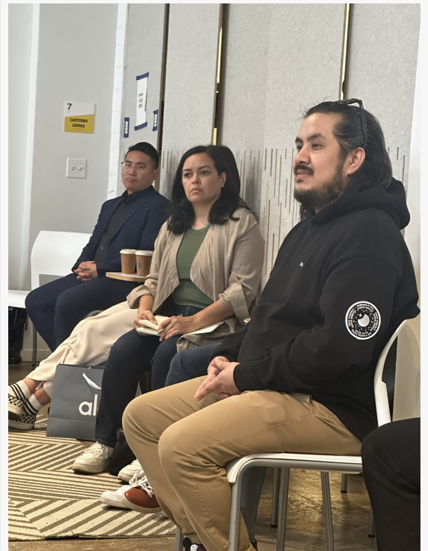
Audience - SSC