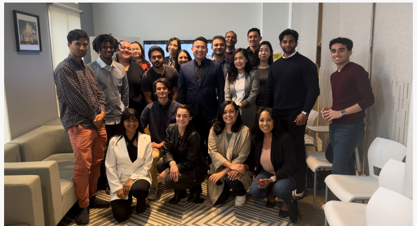
Group picture - Sustainable supply chain