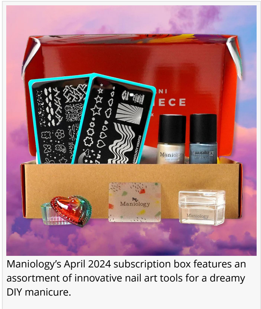
Maniology's April 2024 subscription box features an assortment of innovative nail art tools for a dreamy DIY manicure.

Mani x Me Box subscribers will also receive early access to two exclusive polishes: "Raindrop"