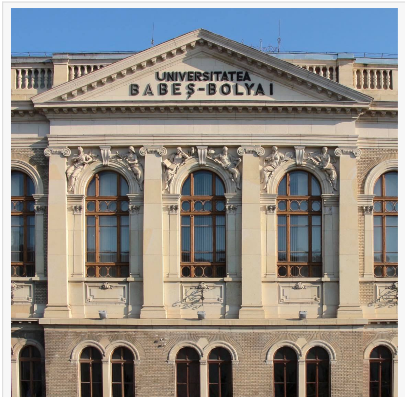
Babeş-Bolyai University main buildingg

The scientific project to monitor developments in the Romanian economy started during the coronavirus pandemic. It was a situation with a high degree of uncertainty, in which public communication was disturbed by conspiracy theories, elements of fake news and contradictory statements by public authorities, preoccupied with solving urgent situations and lacking the clarity needed to make real-time analyses and forecasts.