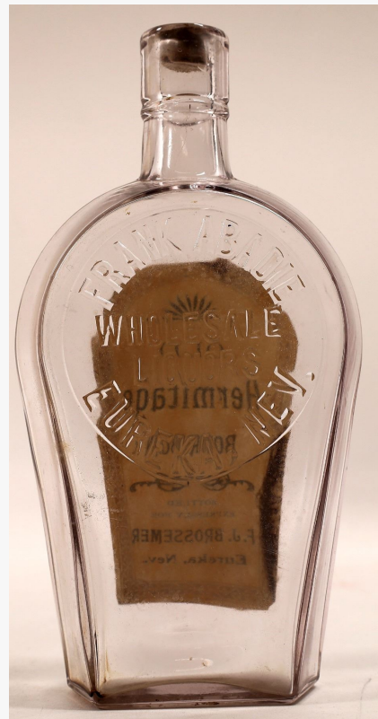
Frank Abadie pint-size, knife edge coffin Nevada whiskey bottle with the original paper nearly intact, clear in color, circa 1884-1886, one of the top Nevada whiskeys (est. $2,400-$4,000).