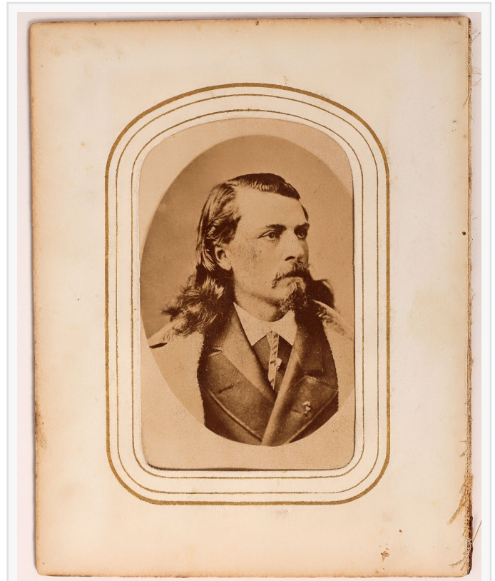
Circa 1870s carte de visite of Buffalo Bill Cody, made by the Theatrical Photography Company and depicting the Wild West showman in his younger years (est. $10,000-$20,000).

Lot 2218 is a circa 1870s carte de visite of Buffalo Bill Cody, made by the Theatrical Photography Company and depicting the Wild West showman in his younger years. The CDV is in a frame of 4 inches by 5 inches (est. $10,000-$20,000). Lots 2289-2293 are stock certificates issued to, and