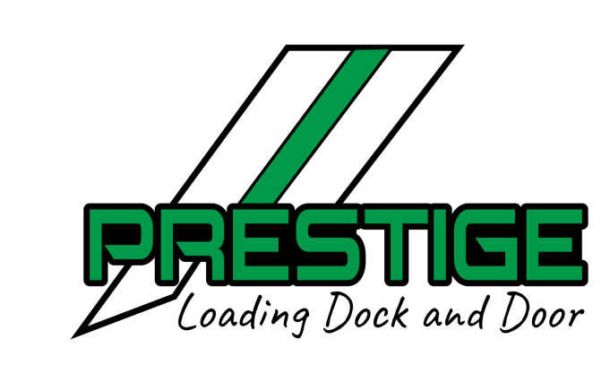
Prestige Loading Dock and Door Logo

These sophisticated security measures provide heightened protection against theft, vandalism, and unauthorized access, ensuring the safety of valuable goods and materials stored or unloaded at docks and warehouses.