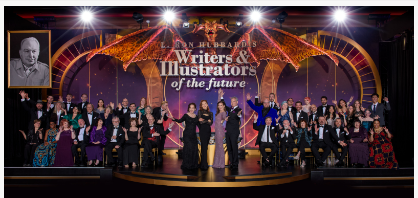
Writers & Illustrators of the Future Winners and Judges for 2023 posing on stage at the L. Ron Hubbard Awards Gala

HOLLYWOOD, CA, UNITED STATES, March 27, 2024 /EINPresswire.com/ -- Year 40 for L. Ron Hubbard Presents Writers of the Future marks yet another milestone for the Contests as Galaxy Press and Author Services, Inc., L. Ron Hubbard's literary agency, prepare for its April 25 gala honoring winners flown in from eight countries to receive their trophies and be acknowledged as the best new writers and illustrators of science fiction and fantasy: Canada, China, Malaysia, Netherlands, New Zealand, Portugal, United Kingdom, and United States of America.