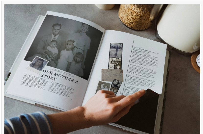
Momma's Kitchen Cookbook Family Stories

Join us on a culinary journey through the heart and soul of the South with "Momma's Kitchen Cookbook." From our family to yours, let's savor the flavors of tradition and love.