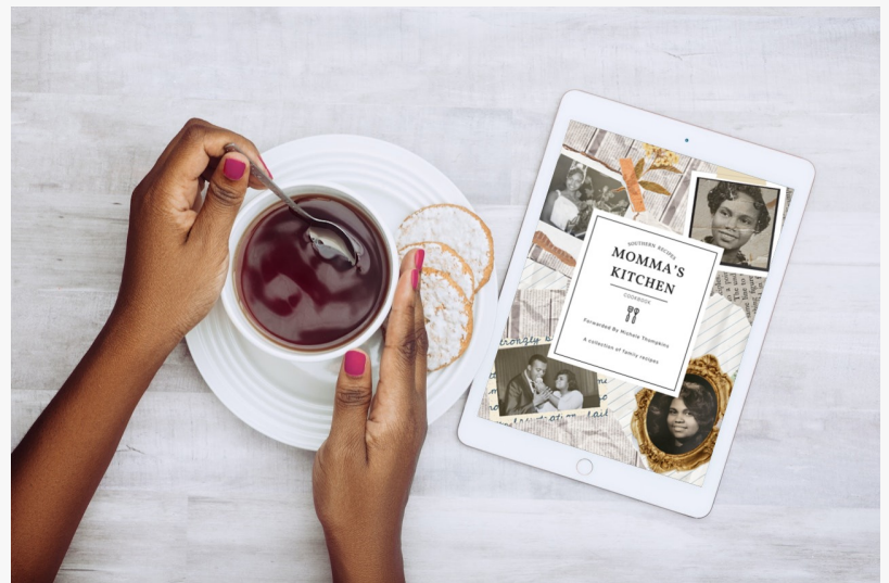
Momma's Kitchen Cookbook eBook